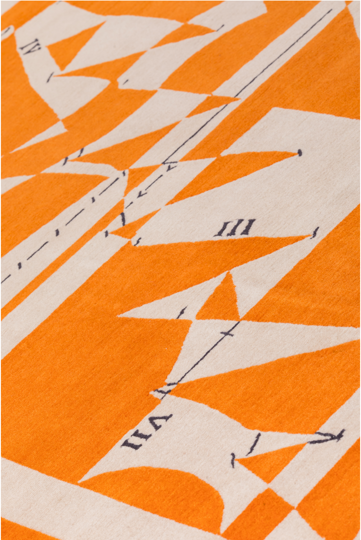
Detail of the Creation .